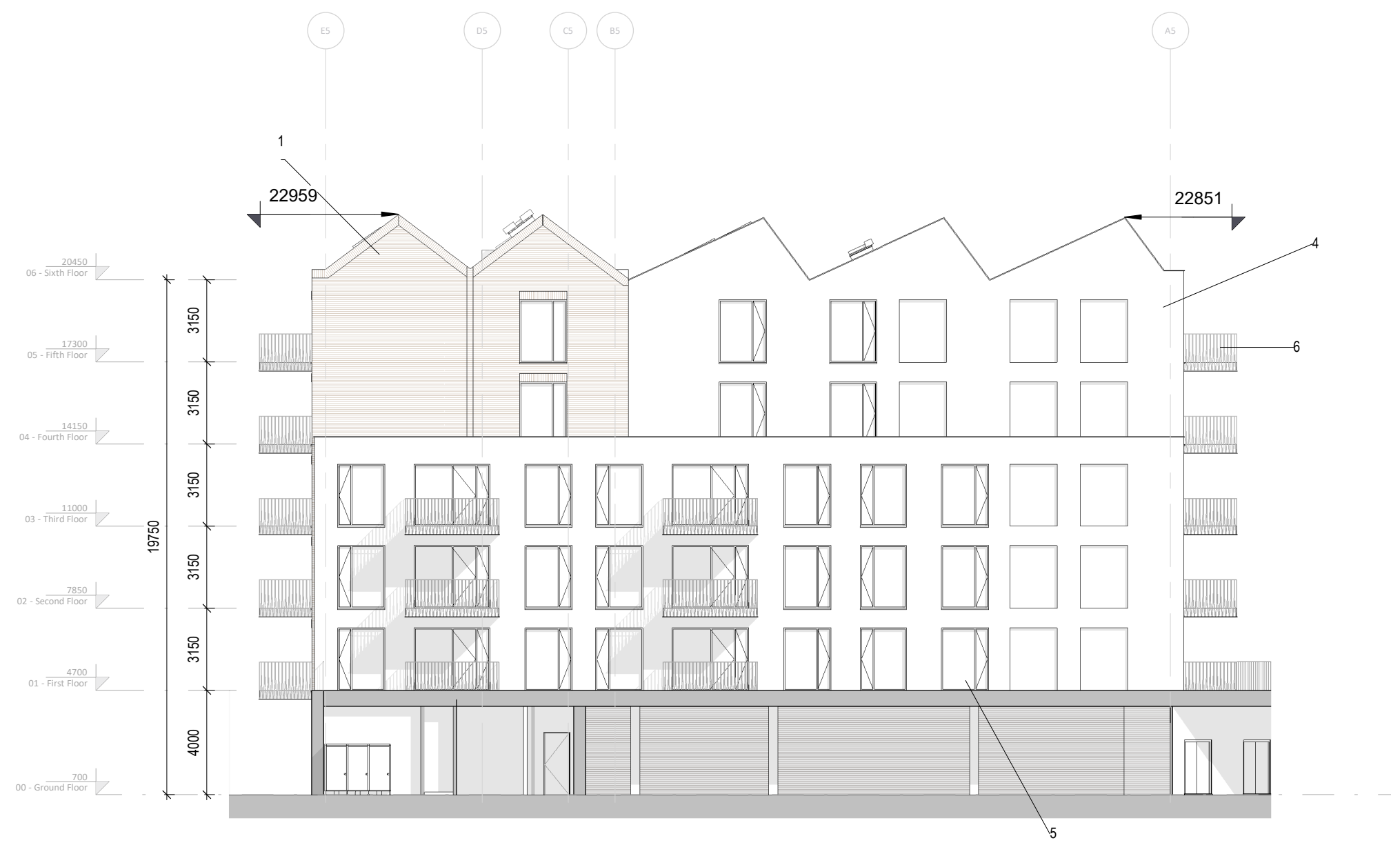
1 B2 East Elevation 1:200