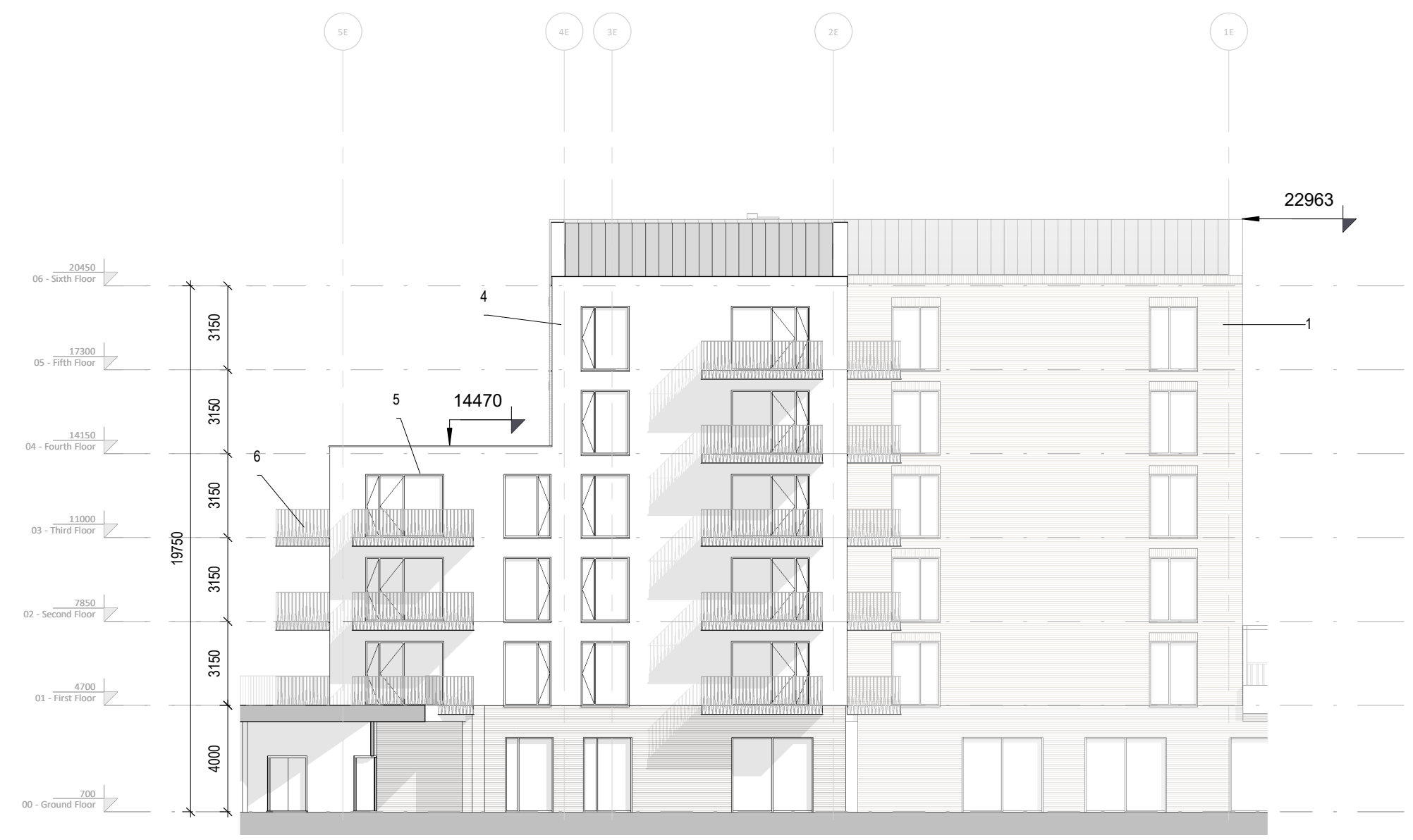
2 B2 North Elevation 1:200