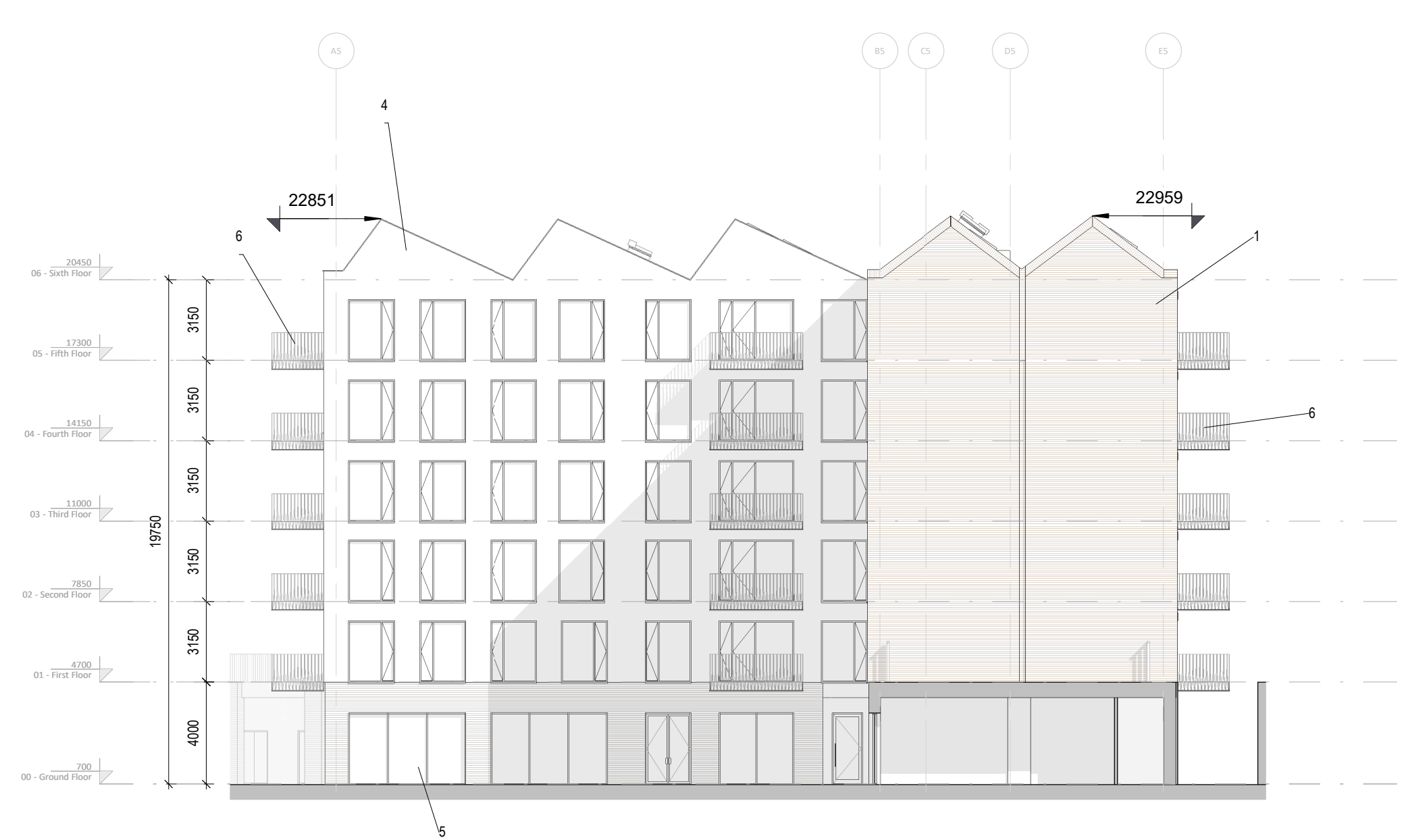
4 B2 West Elevation 1:200